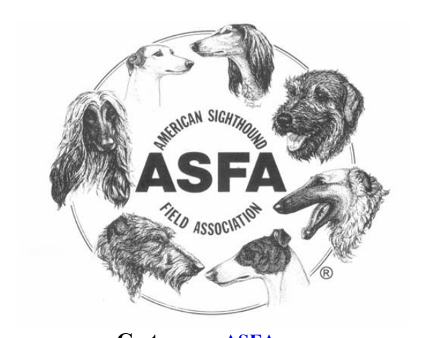
Go to www.ASFA.org

Entry fees USD: $22 first, $20 second, $17 third hound, same household Entry fees CAD: $28 first, $25 second, $21 third hound, same household